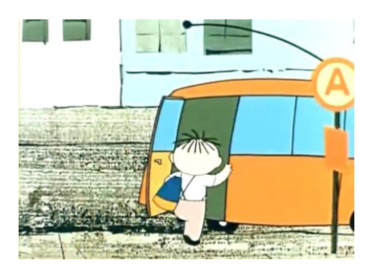
Fig. 1. A boy is getting on a bus

Only some of this mix is construed as salient and coded appropriately in language. As an example, consider the following picture.